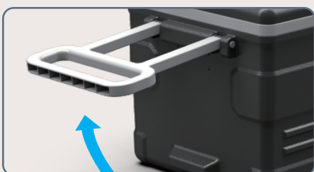
Heavy duty pull rod