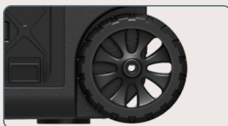
Du ra bie wheels