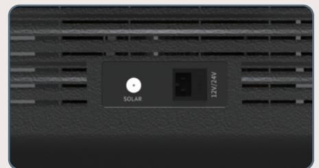
DC/ AC/Solar (optional)